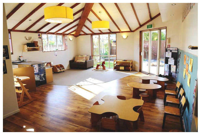
Nursery - Approx 0 to 2 years of age