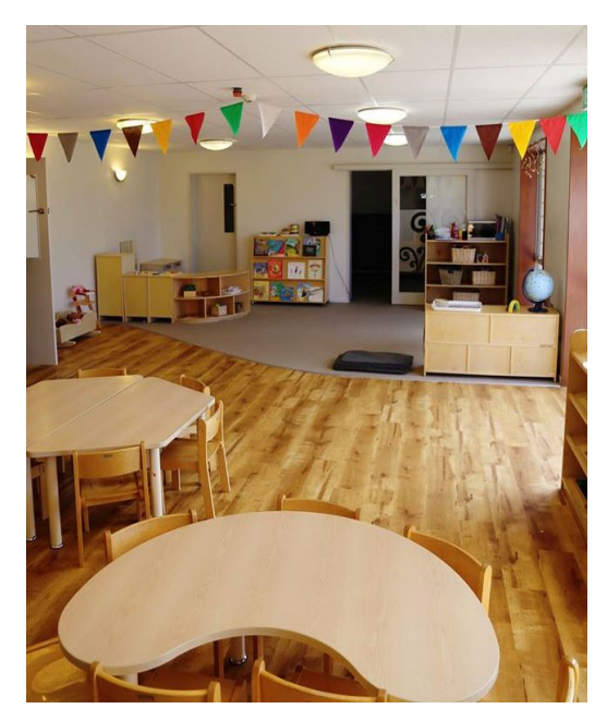
Caterpillar Room - Approx 2 to 3.5 years

The teacher to child ratio is higher than required by the Ministry of Education, and our specialist teachers have strengths in infant child care and development, literacy and numeracy, music, art and physical development. There is 3.2 square metres of internal activity space per child which is well above the 2.5 square metre requirement.