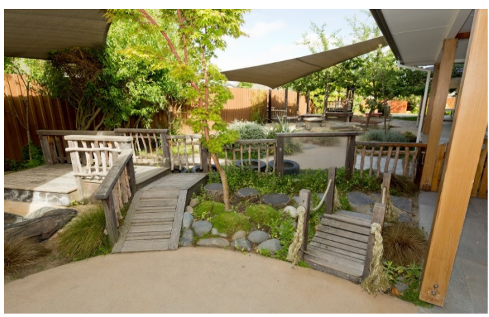
Minerva House offers a considerable 559 square metres of external activity space. This equates to 11.2 square metres per child this is over twice the minimum requirement of 5 square metres per child.