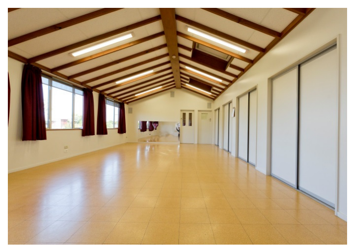
With our 50m² multi-purpose room, separate from our classroom areas, we have valuable space for gross motor development, dance, music, drama and more.

The combination of warm and earthy colours creates a cosy, home-like atmosphere, making the children in our centre feel secure and comfortable. Under floor heating is installed throughout the building to ensure a comfortable, healthy temperature at all times.